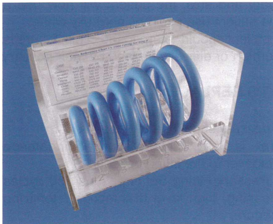
Pessary Fitting Set / Ring Type